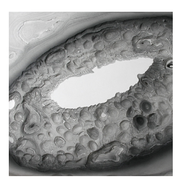
3. Crater #70902, 2012