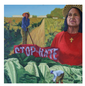
Delores Heurta: Stop the Hate, 2012