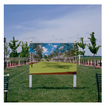
Future Construction, Louisville, KY, 2009