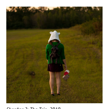
Chapter 2: The Trip, 2010