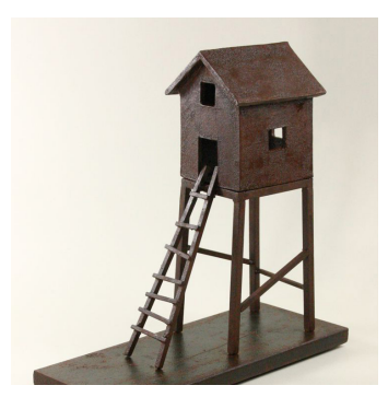
Surge Safe, 2011