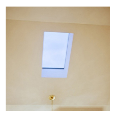
Lake and 5ky, 2011