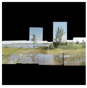
Gulf Cove, 2012