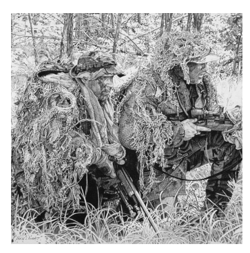
Ghillie Dhu, 2009