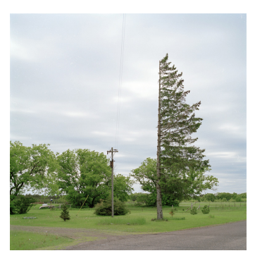
Half Tree, 2011