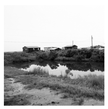
Empty Homes Isle de Jean Charles, 2012