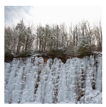
layered wall, 2010