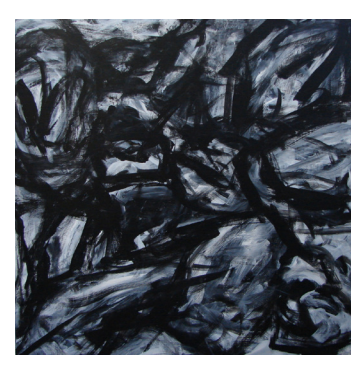
Rocks Abstracted, 2012