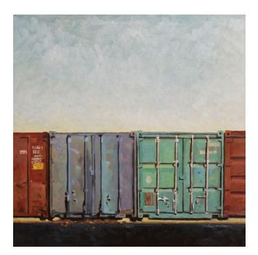
steel storage containers, 2012