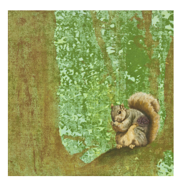
Well, at least he's free, 2012