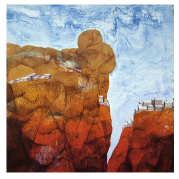
Rocks & Houses, 2008