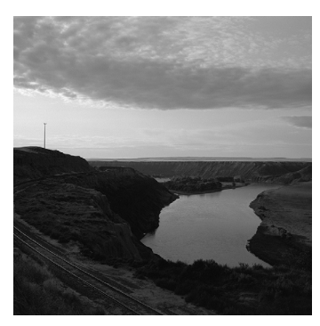
Missouri River, Montana, 2011