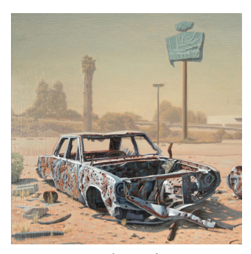
Long Term Parking (Denny's), 2010