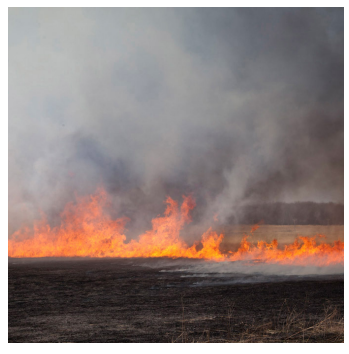
Untitled (Fire), 2012