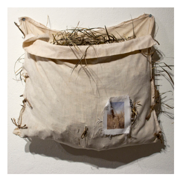
Harvest End, 2012