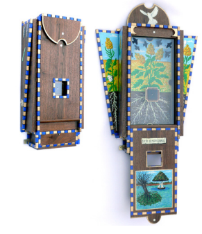
As a Mustard Seed, 2012