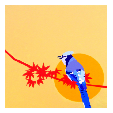
the black sheep blue jay/stays behind/to experience autumn, 2011