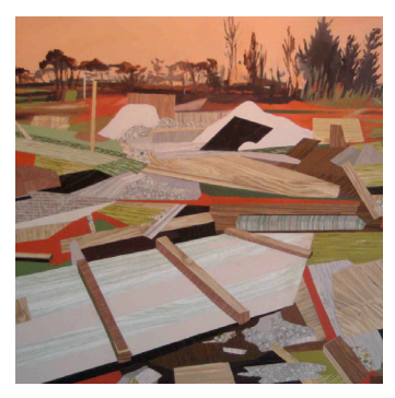
Rapid Response, 2011