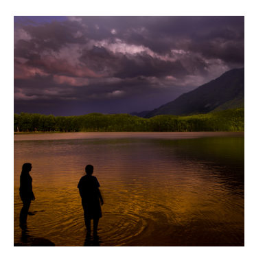
Storm is coming in Alaska, 2011