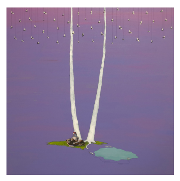
we never end up like we imagine as children. 2012