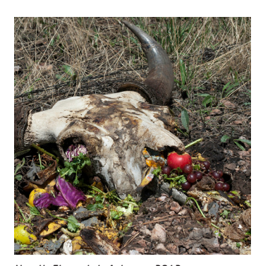
N soil, Firepoint, Arizona, 2012