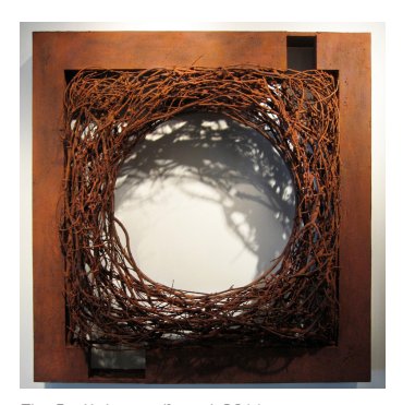
The Earth Loams Round, 2011