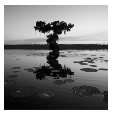
Cypress, Lake Martin, 2011