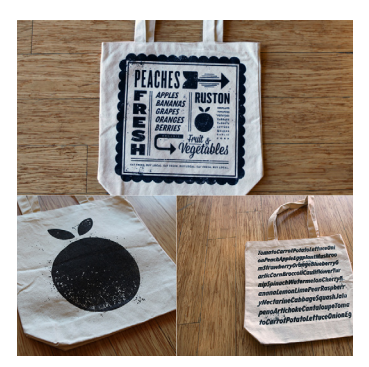
Farmer's Market Tote Bags, 2012