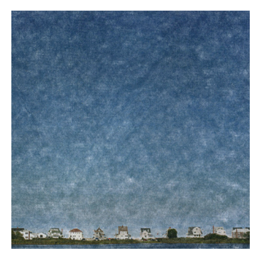
Fenced Free, 2012