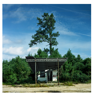
We Doze But Never Close, Tuskegee, AL, 2012