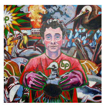
Deep Water Horizon Disaster: Louisiana Landscape, 2010