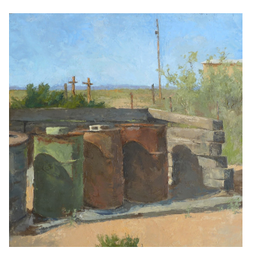
Trash Cans at the Lord's Ranch, 2012